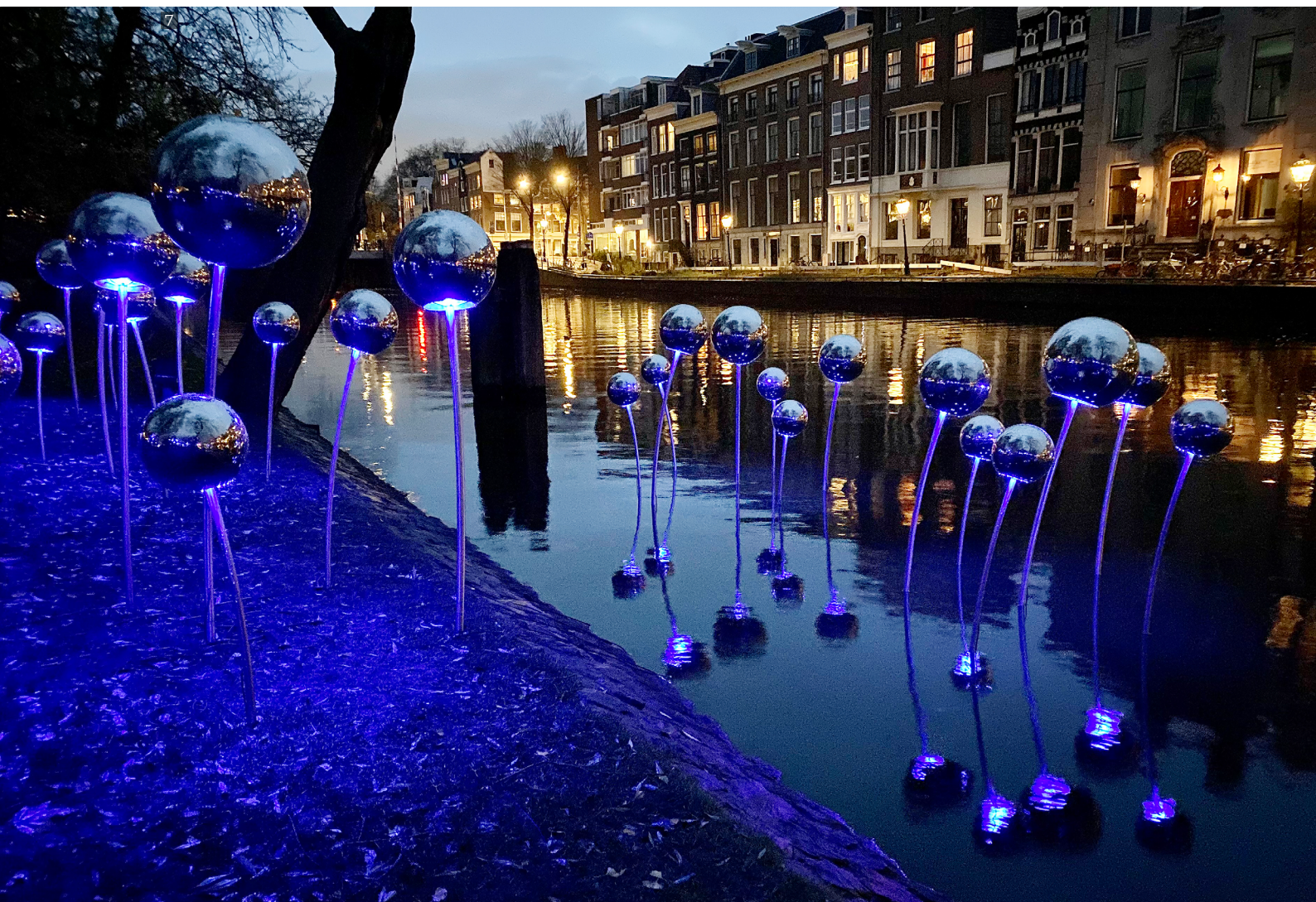
6. & 7. A floating installation at the Amsterdam Light Festival, utilizing water as a natural reflector and creating ethereal lighting effects through subtle illumination and sculptural design